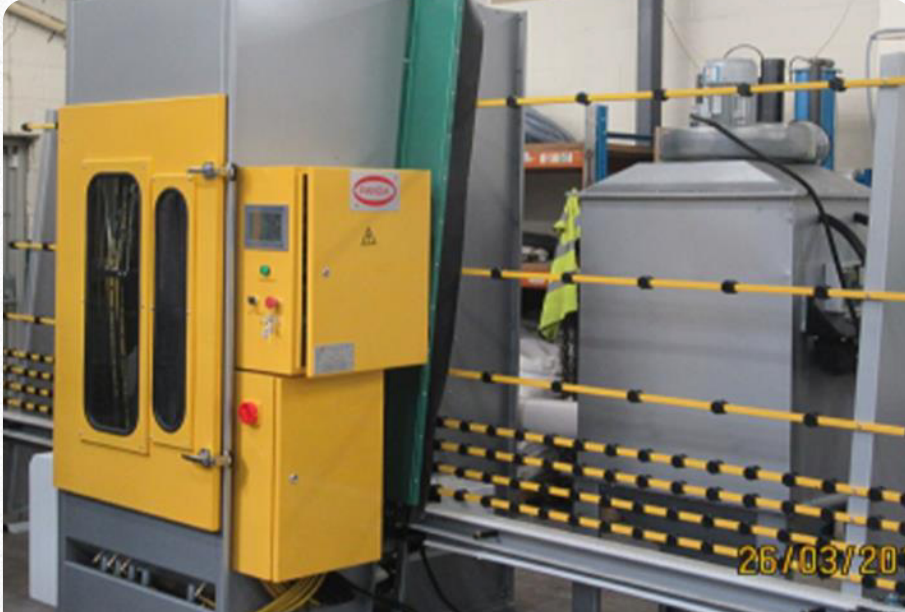
1600mm model testing in Hinckley prior to delivery.