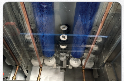
All stainless components and easy access make maintenance easy and downtime low.