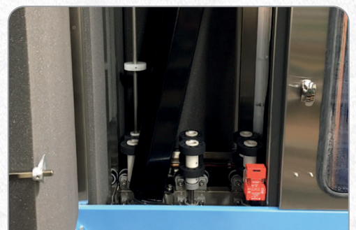
Safety interlocks on all doors