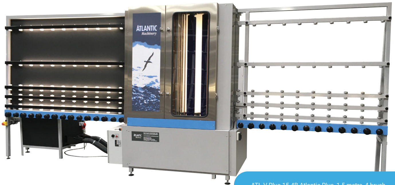
ATL-V Plus-15-4B Atlantic Plus, 1-5 metre, 4 brush