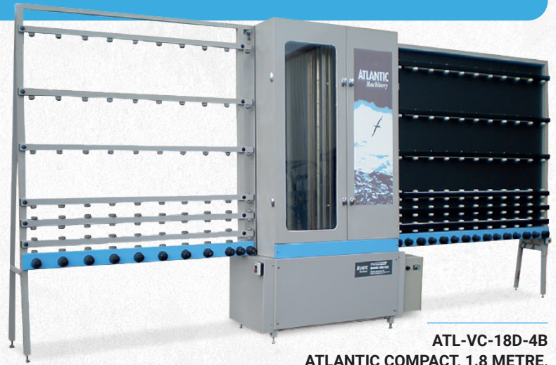
ATL-VC-18D-4B ATLANTIC COMPACT, 1.8 METRE, 4 BRUSH WASHER