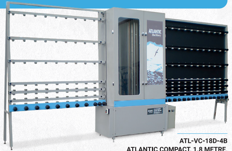
ATL-VC-18D-4B ATLANTIC COMPACT, 1.8 METRE, 4 BRUSH WASHER